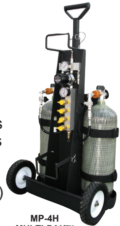
MP-4H MULTI-PAK™ Air Cart