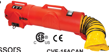
CVF-15ACAN VCV Axial Fan