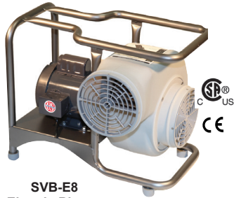
SVB-E8 Electric Blower