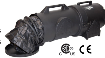
CVF12EXP15 Explosion-Proof 12" VCV Axial Ventilation Kit