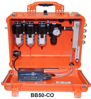
BB50-CO Breather Box®