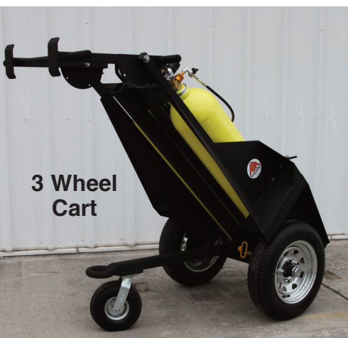
Cylinders Not Included

4 outlet manifold with regulator, relief valve, pressure gauges, and low pressure alarm whistle