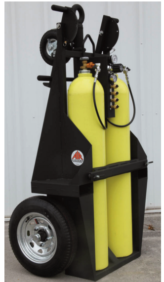
Store Upright For Smallest Footprint

Empty 262 lbs. With two 444 cf air cylinders 570 lbs.