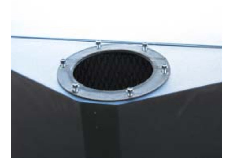
Note: When mounting the fume extractor arm, index tabs as shown here.

The Fume Air 750 is delivered in 2 pieces. The cabinet is supplied with filters installed and the 10' arm is in a separate box. Remove the arm assembly from the box. The screws to secure the arm to the cabinet are threaded into the mounting inlet on the cabinet.